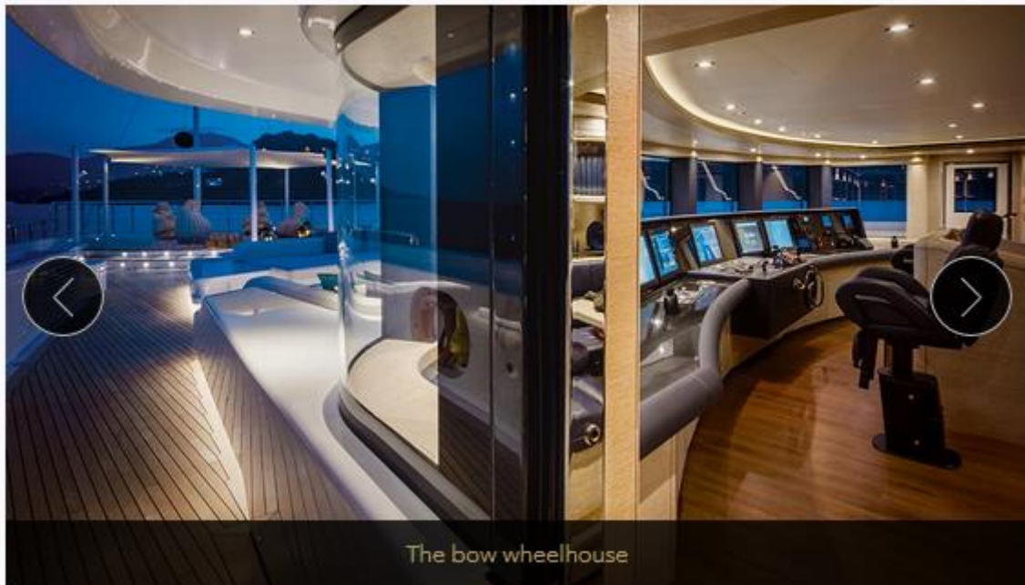
The bow wheelhouse

Studio Zuccon International Project handled the exterior lines and internal layout. No small feat considering it had to balance the goals of maximising space and seamlessly integrating her exterior and interior living areas. All the while ensuring it still looks elegant on the exterior. Needless to say, with all that, it requires an equally beautiful interior to match, a task design heavyweights Winch Design was more than up to.