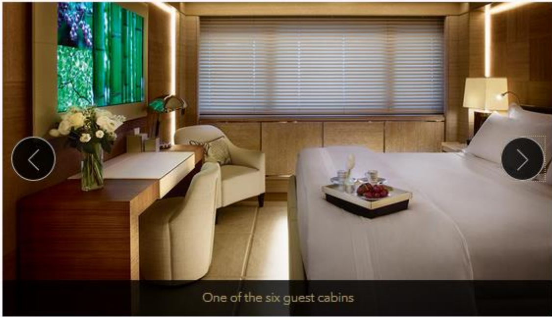
One of the six guest cabins