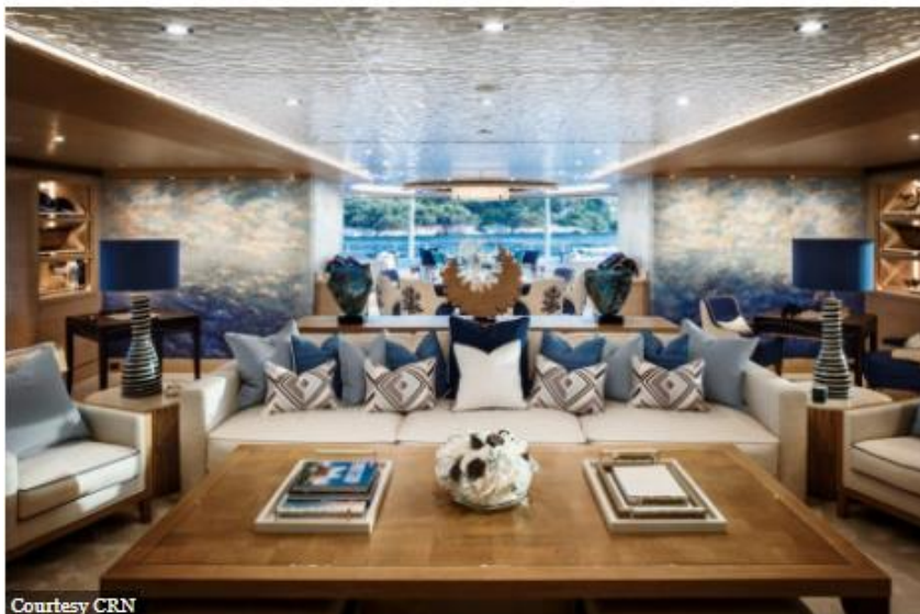
Cloud 9's interior impresses from every angle.