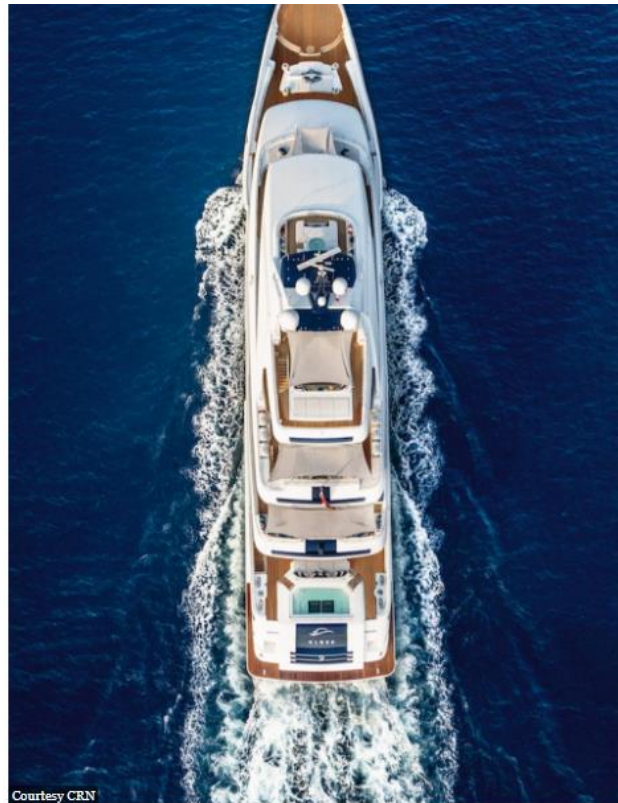
This is what luxury looks like from above.