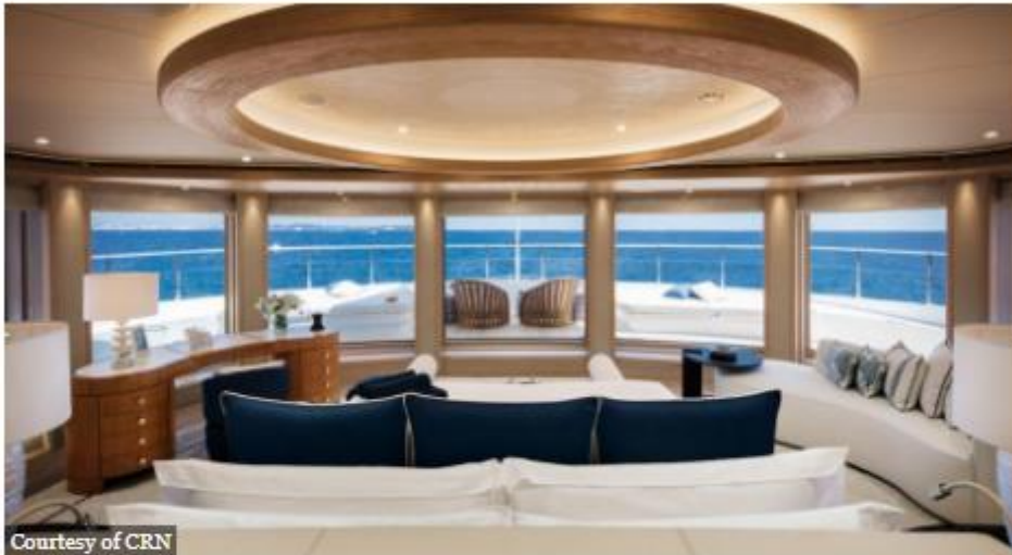
A view fit for a king in the Owners cabin

The private access to the owner's deck consisting of approximately 4,300 square feet of space – leads directly into the media room. A particular design detail that is found here and across the owner's level is the custom-made mixed white wool and silk carpet.