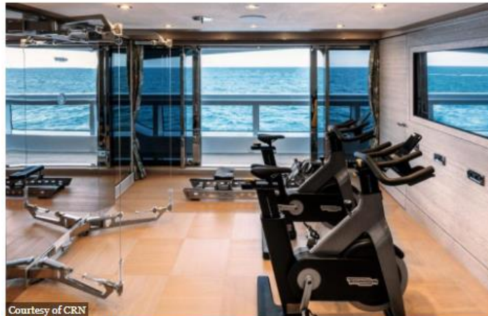
A gym with a view

An internal stairwell leads to the upper deck which houses a stylish open-plan saloon/dining area filled with natural light, featuring a mural depicting a tranquil sky scene.