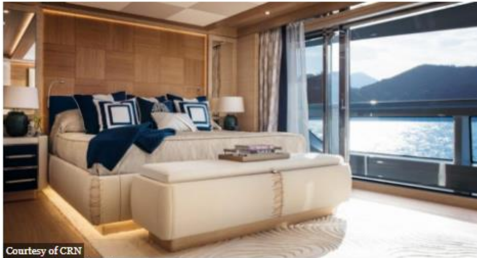
One of six guest suites

The six guest cabins are styled like the main saloon but different finishes to embellish each room. The walls are paneled in bleached oak, contrasting with the natural wood used for other areas.