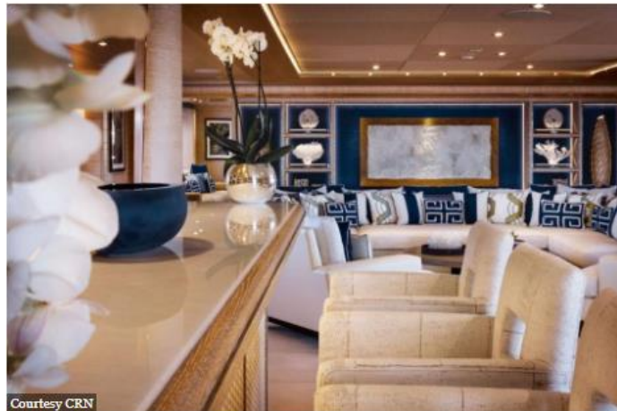
Main saloon

The overall design features symmetrical linear patterns, tactile textures, and bleached woodwork that's carried throughout all the yacht's interior spaces. In the main saloon, bleached oak cladding is used with the wood's grain converging precisely in an uninterrupted continuum of lines. Custom made lintels and columns give an aristocratic appearance to the space, while a glass sliding door separates the main saloon from the forward guest areas. The saloon can also be transformed into a full-on cinema when a large screen and projector descends from the ceiling.