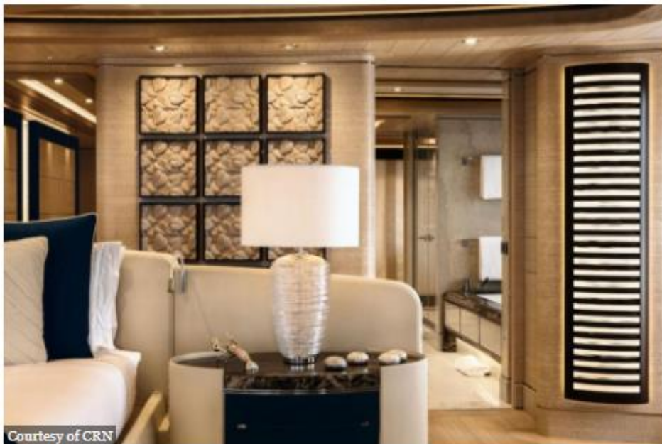
The details.

The private access to the owner's deck consisting of approximately 4,300 square feet of space – leads directly into the media room. A particular design detail that is found here and across the owner's level is the custom-made mixed white wool and silk carpet.