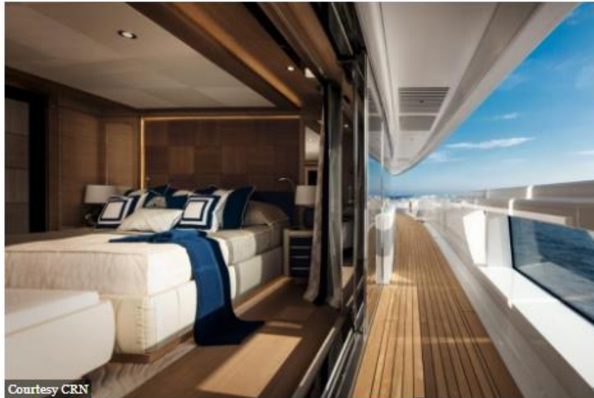
A room with a view.